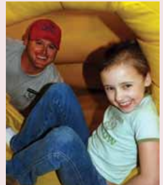
Kids Korner at the 2009 Annual Meeting.